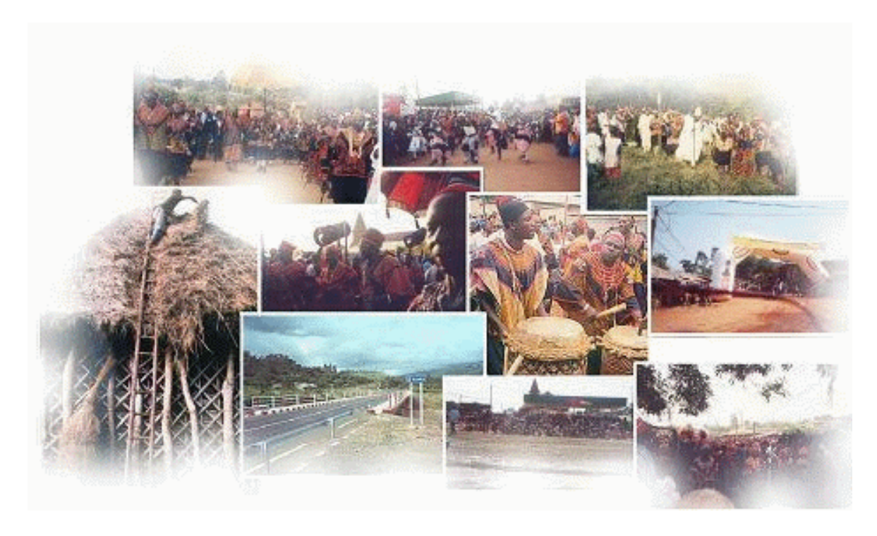
Figure 1 – Some Scenes from Bali